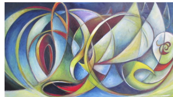
Judy Gittelsohn, Odyssey , 2014, acrylic, 40" x 72"